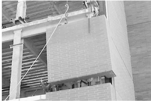
Figure 15-59 Lifting a prefabricated masonry panel into place.