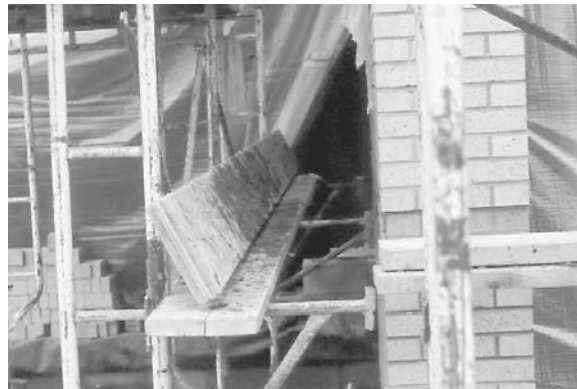
Figure 15-58 Turn scaffold boards on edge at the end of the day to avoid splashing mortar droppings or dirt onto the face of the wall.

and cost effective. Few, if any, construction tolerances are based on hard data or engineering analysis. There has also never been any coordination among various industry groups even though steel and concrete are used together, masonry is attached to or supports both, windows must fit into openings in all three, and sealants are expected to fill all the gaps left between adjacent components.